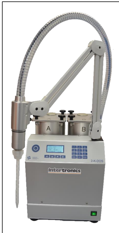
Figure 2 – A metering, mixing and dispensing machine for larger quantities of materials

One solution is to use a metering and mixing machine, where measured amounts of material are fed through a mixing nozzle and can then be dispensed directly to the part. Systems operating with gear pumps or piston pumps are readily available but are more suited to larger material quantities, such as potting transformers.