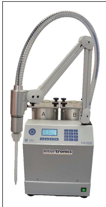
Figure 2 – A metering, mixing and dispensing machine for larger quantities of materials

One solution is to use a metering and mixing machine, where measured amounts of material are fed through a mixing nozzle and can then be dispensed directly to the part. Systems operating with gear pumps or piston pumps are readily available but are more suited to larger material quantities, such as potting transformers.