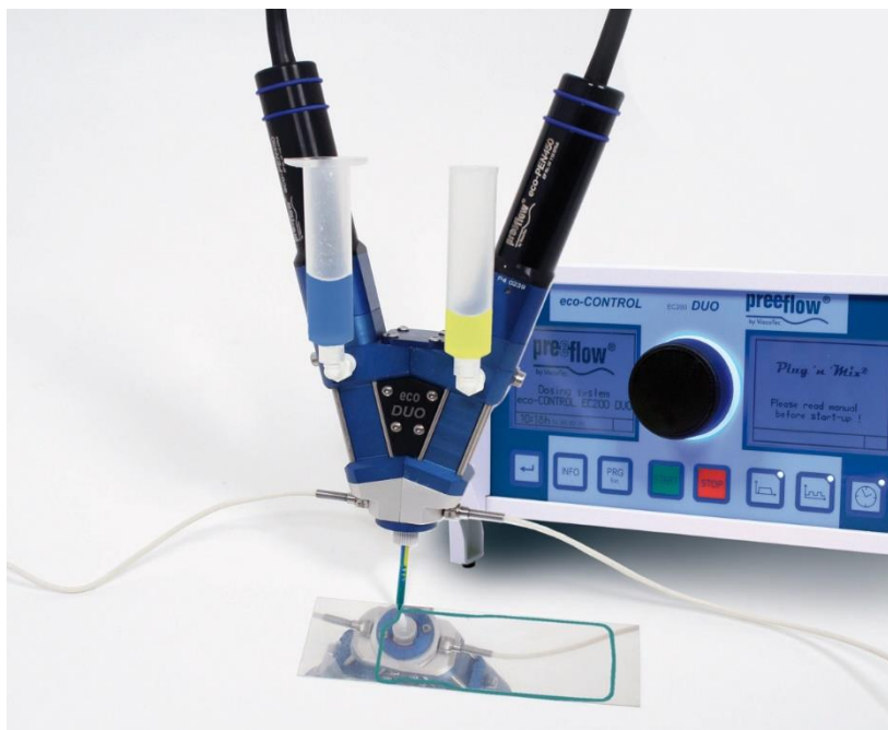
Figure 4 – preeflow eco-DUO metering, mixing and dispensing machine with progressive cavity pump

One example of such technology is the preeflow eco-DUO, a highly precise volumetric metering, mixing and dispensing unit, which integrates two preeflow eco-PENs through a manifold and static mixing nozzle. Suitable for a wide range of materials with viscosities from water up to pastes, it enables flow rates from 0.1 to 32 ml/minute, with dispensed volumes as low as 0.005 millilitres. It also offers a mixing ratio of up to 10:1, which can be changed dependent on the project. The variable mix ratio means that unlike many other systems, the user is able to reconfigure it for different materials, rather than sending it back to the system manufacturer for modification.