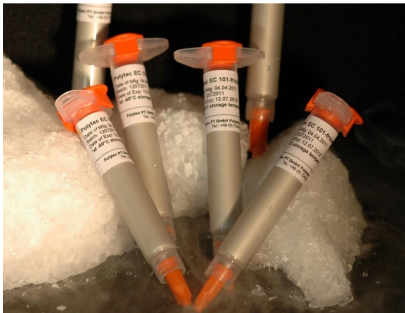
Figure 1 – Pre-mixed and frozen two-part adhesives supplied in syringes

Two-part formulations can offer superior cured performance but can be difficult to process. A typical method involves weighing out the constituent parts, mixing in a container with a spatula and loading into a dispensing syringe barrel for application. There may be a vacuum degassing or centrifuge step to remove entrapped air. Some suppliers offer respite from this procedure by providing their materials in a pre-mixed, degassed and frozen packaging. However, there are extra costs associated with shipping and storage, which is ameliorated by the material being ready to use after thawing.