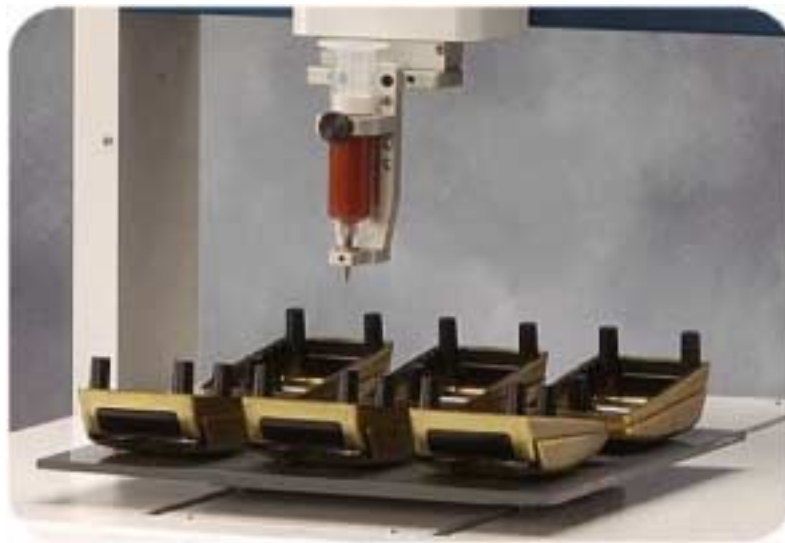
Figure 2 – Adhesive dispensing on complex, 3-D parts

All types are suitable for semi-automatic batch operation, where the work is manually loaded/unloaded. The SCARA and Gantry types will also work with automatic feed by, for example, being placed next to or over a conveyor.