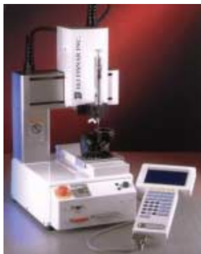
Figure 1 – FIP gasket application on a small, semi-automatic robot

With a decade of installed units to reference, this category of machines have shown remarkable reliability. Maintenance is relatively simple, and they are built robustly and fit for shop floor use. They may incorporate self diagnostic procedures in case of malfunctions.