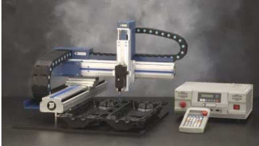
Figure 4 – A table top gantry robot on some larger parts

Moreover, prices start at about £5,000.00. This brings the technology into the budget range of almost all manufacturing concerns. At this price level, cost justification by reasons of higher throughput and yields, fewer rejects, better quality or reduced labour content are relatively straightforward. Payback times can be as little as six months.