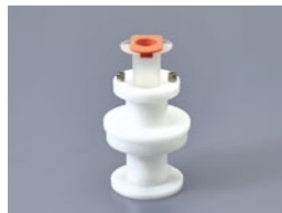
100AD-10S For 10 ml syringe