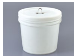
4000 ml container