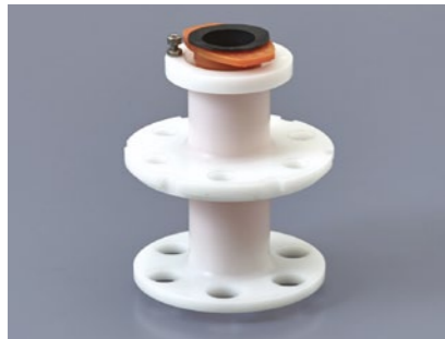
250AD-30S For 20/30 ml syringe

● We provide various adapters for syringes and barrels. Contact us for items not listed.