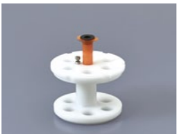
250AD-3S For 3 ml syringe