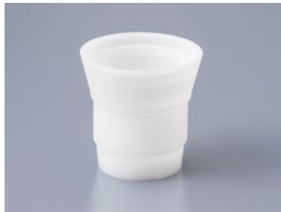
50AD-NAN-U58 For Umano UG 58 ml