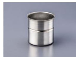
300 ml SUS 300 ml SUS container

* Other types of containers (eg. container lid with a hole) are also available. Contact us for details.