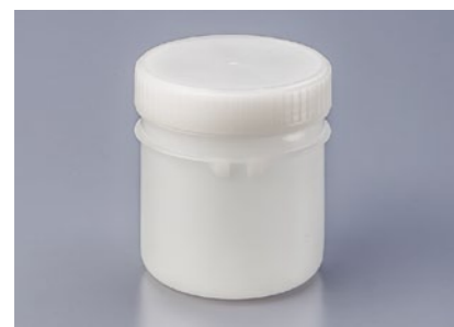
300 ml container

● Disposable cups and plastic containers.