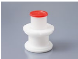
250AD-100BS For 100 ml barrel