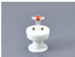
100AD-3S For 3 ml syringe