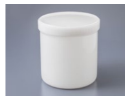
1000 ml container