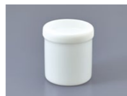
550 ml container

* 360 ml container without keyways [Type F] is also available.