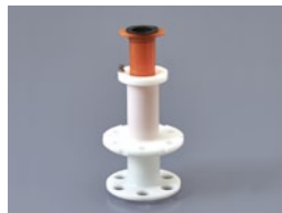
250AD-50S For 50 ml syringe