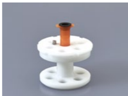
250AD-5S For 5 ml syringe