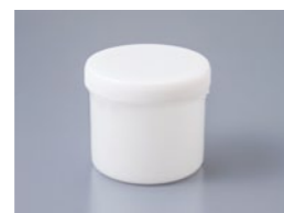
250 ml container