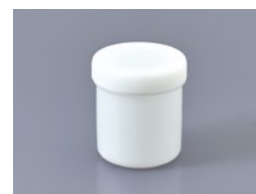
150 ml container