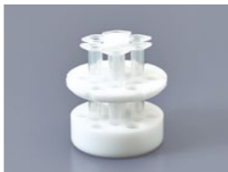
250AD-M3S×6 For Musashi syringe 3 ml×6

* All the syringes/barrels shown in the pictures above are not included.