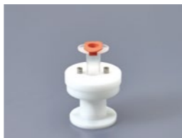
100AD-5S For 5 ml syringe