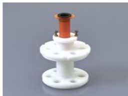
250AD-10S For 10 ml syringe