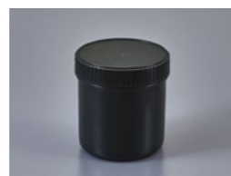
300 ml anti-UV container

* 160 ml anti-UV container is also available.