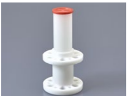
500AD-170B For 170 ml barrel