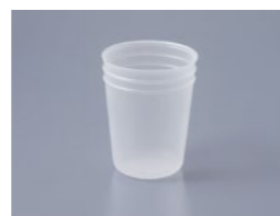
100 ml disposable cup