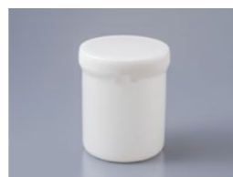
360 ml container [Type K] With keyways

* 160 ml anti-UV container is also available.