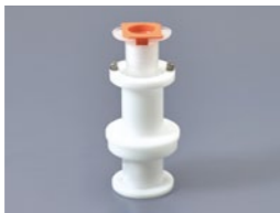
100AD-30S For 20/30 ml syringe