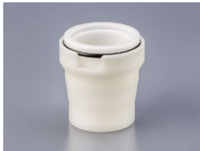
100AD-NAN-U For Umano UG 12 ml, 24 ml, 35 ml