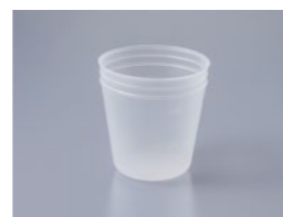
200 ml disposable cup