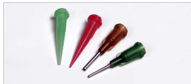
Figure 2. Taper and Needle Dispensing Tips

Manufacturers can select from a wide variety of dispense tips to find the best tip for their specific application. Tips are typically made of stainless steel or plastic. When dispensing light-curable adhesives, plastic dispense tips must be impervious to all light so that the adhesive will not cure in the dispense equipment and create blockages. In certain cases, dispense tips may also be shielded from light to prevent premature cure.