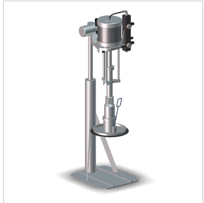
Figure 3. Ram Pump System

If the same type of thixotropic fluid were to be dispensed through a pressure pot, higher pressures would be needed to push the material down. This excess pressure can push air bubbles into the adhesive, or even past the adhesive, which would result in air reaching the valve. It can also cause cavitation, a condition where the adhesive is pushed to the sides of the pressure pot creating a cavity in the center.