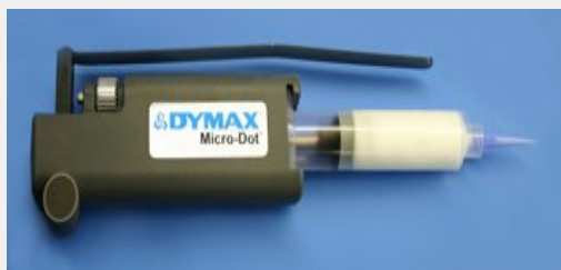
Lever Activated Micro-Dot Syringe Dispenser