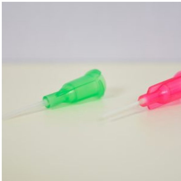
Flexible and bendy