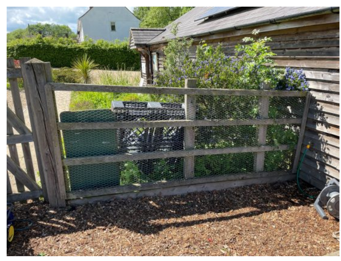
The chicken wire is

replaced on the fence, keeping the kids safe and contained