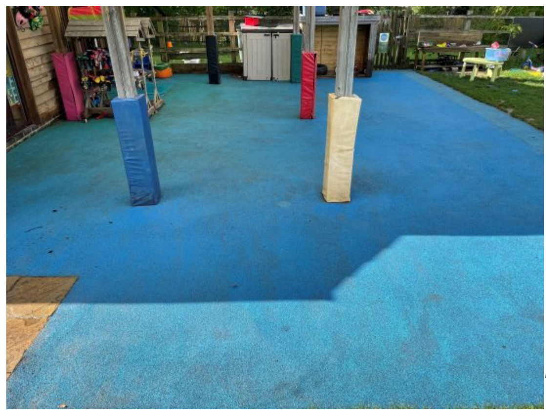
the floor is blue under there!