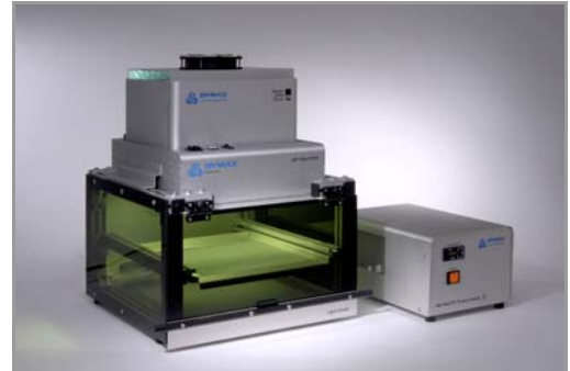
Shielded Light-Curing Chambers

© 2002 - 2010 DYMAX Corporation, All rights reserved. All trademarks in this guide, except where noted, are the property of, or used under license by DYMAX Corporation, U.S.A.