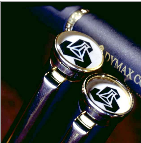
Dome-Coated Pen Tops

DYMAX Light-Weld® and Ultra Light-Weld® light-curable dome coatings create crystal-clear protective coatings in seconds upon exposure to ultraviolet light. The instant, on-demand cure "locks out" airborne contamination. Optimized product flow allows consistent shape, producing consistent domes, resulting in fewer rejects. The higher-viscosity coatings are engineered for producing curved domes, which optically magnify and enhance the appearance of labels and images. Fast cure times allow for greater productivity and less inventory. No mixing, racks, or ovens are required. UV curable dome and decorative coatings are solvent free and do not contain mercury or isocyanates. Light-curable dome and decorative coatings are ideal for coating labels, badges, nametags, pens, key chains, decals, and novelties.