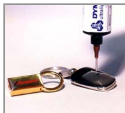
DYMAX 4-20508 with a high-gloss finish is used to coat key chains.