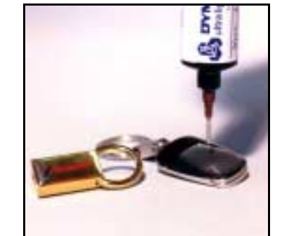
DYMAX 4-20508 with a high gloss finish is used to decoratively coat key chains.