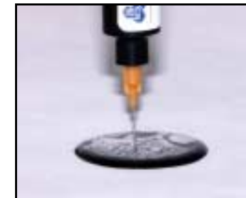
DYMAX 4-20577 is used to coat a medium size decal.