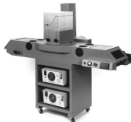
Conveyorized Curing Systems