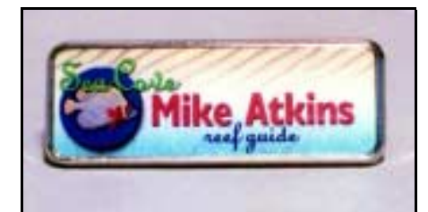
DYMAX 4-20508 is used as a high gloss dome coating on a nameplate.