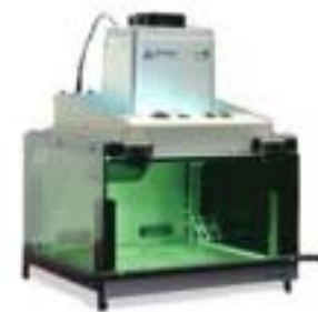
Shielded Light Curing Chambers