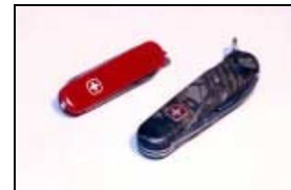
DYMAX 4-20624 and 4-20638 low and high gloss coatings are used to entirely cover the handles of knives.