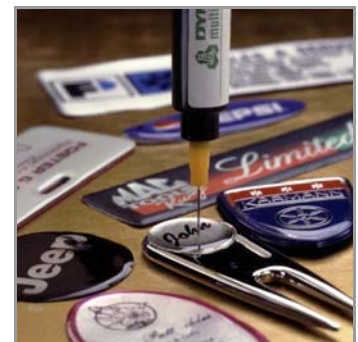
Dome-Coated Novelty Products