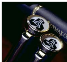
DYMAX 4-20564 is used to dome coat a pen cap.