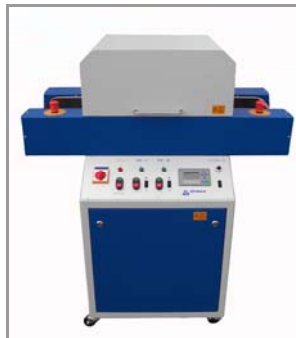
Conveyorized Curing Systems