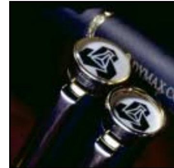
DYMAX 4-20435 resin is used to seal a label in a pen cap.