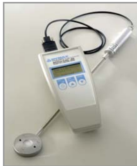
Radiometers for Process Control