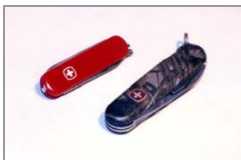
DYMAX 4-20638 high-gloss coating is used to cover knife handles.