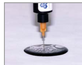
DYMAX 4-20577 is used to coat a medium-size decal.